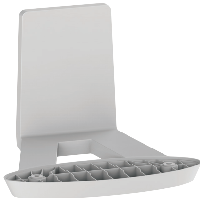
Wall mount cover