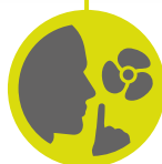
Silent cooling stand