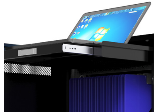
Sliding rack for notebook up to 17"

Tiroirs coulissants pour notebook jusqu'à 17"