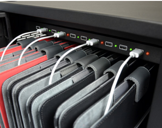
Charge progress LED indicator