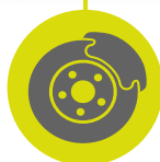
Omni directional wheels + brakes