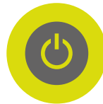
Charge indicator LEDs