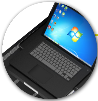
1 sliding rack for notebook 1 tiroir coulissant pour notebook

CABINET DE CHARGE 20 TABLETTES + 1 NOTEBOOK