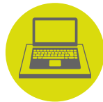
Sliding rack for notebook