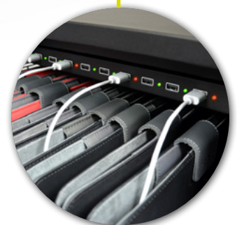
Charge progress LED indicator Indicateur LED de progression de chargement