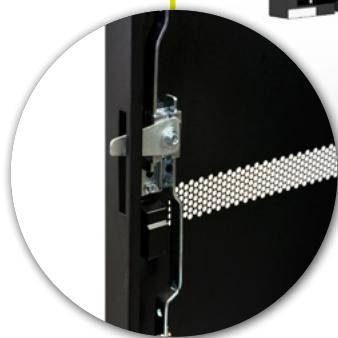
3 points lock Fermeture 3 points