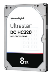
Ultrastar DC HC320