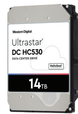
Ultrastar DC HC530