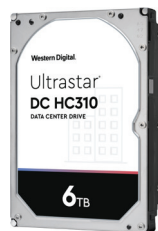
Ultrastar® DC HC310 (7K6)

Hard drive random-write performance is limited because you need to physically move the drive head to the track being written, which can take several milliseconds. Western Digital's media cache architecture is a disk-based caching technology that provides large non-volatile cache areas on the disk. This architecture can improve the random small-block write performance of many Hadoop workloads by providing up to three times the random write IOPS. Unlike a volatile and unsafe RAM-based cache, the media cache architecture is completely persistent and improves reliability and data integrity during unexpected power losses. No Hadoop software changes are required to take advantage of this optimization, which is present on all 512e (512-byte emulated) and 4Kn (4K native) versions of the drives in this paper.