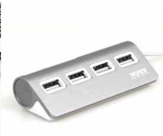
Super fast USB 2.0 hub with high quality aluminium body Hub USB 2.0 ultra rapide avec corps en aluminium de qualité