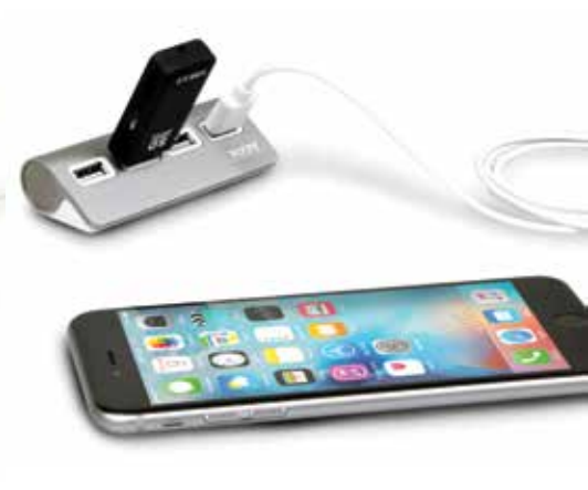
Plug up to 4 USB devices at the same time Branchez jusqu'à 4 périphériques USB en même temps