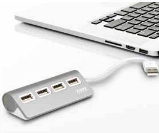
Allows to transfer your data and charge your devices Permet de transférer vos données et charger vos appareils