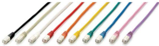
Cat.6 S/FTP Patch Cord